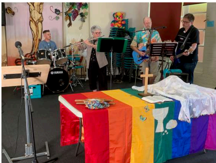
And a time to worship....

(2026 calendar is at the end of the Newsletter)