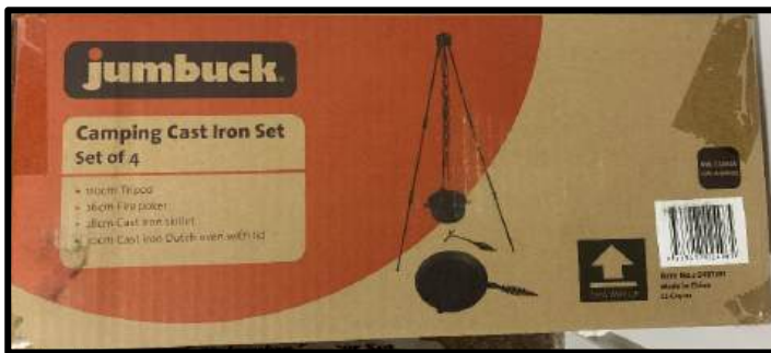
Item A Jumbuck Camping Cast Iron Set of 4 Valued at $150

(Nb: All $ raised go to CMEC to support Community running costs).