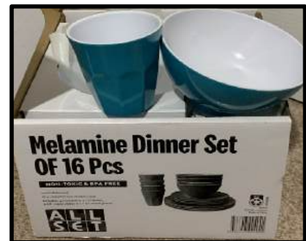
Item B ALL SET Melamine Dinner Set 16 pieces Valued at $39